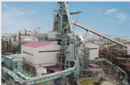
NSSMC Wakayama, Japan