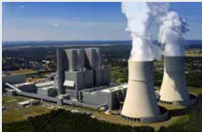
Schwarze Pumpe, Germany

We are proud of having satisfied customers all over the world over years and decades.